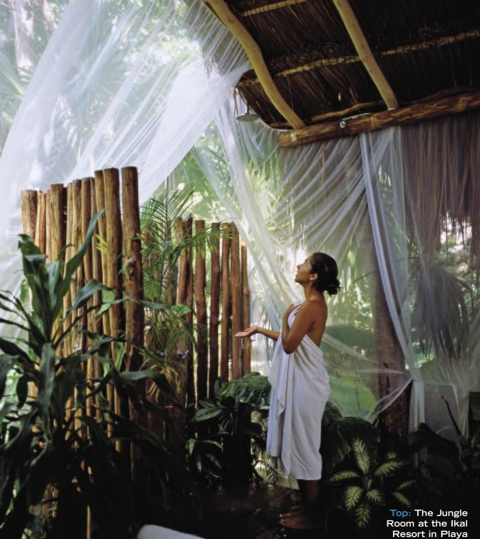
Top: The Jungle Room at the Ikal Resort in Playa del Carmen; bottom: Clay massage at Maya Tulum Wellness Retreat & Spa