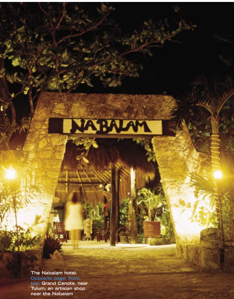
The Nabalam hotel. Opposite page, from top: Grand Cenote, near Tulum; an artisan shop near the Nabalam

"I'M DEFINITELY IN THE RIGHT PLACE FOR SOME serious exposure TO YOGA."